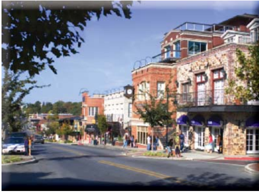
West Dickson Street