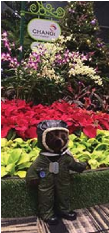
With the flowers at Changi Airport, Singapore