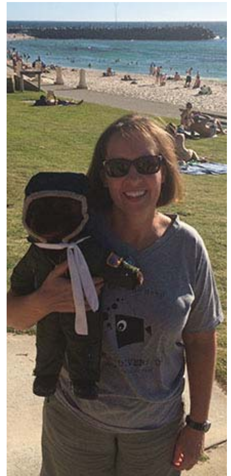
At Cottesloe Beach Christmas Day