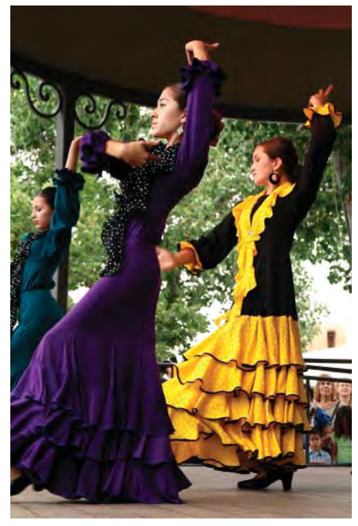
The Andalusian Flamenco dance style encompasses guitar, singing and dance with rhythmic hand-clapping and finger-snappling, and is very popular in Santa Fe