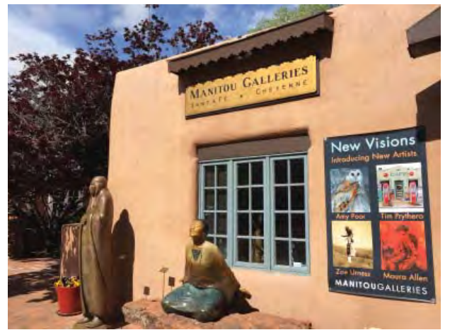
Manitou Galleries, site of our Friday evening reception on famed Canyon Road, and one of the finest galleries in Santa Fe