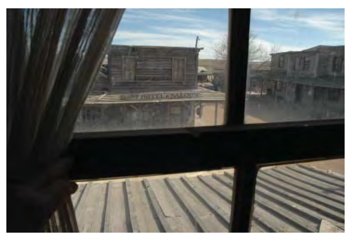
StudioTour -- Main Street at Bonanza Creek Ranch, Scene One of the Studio Tour on Friday